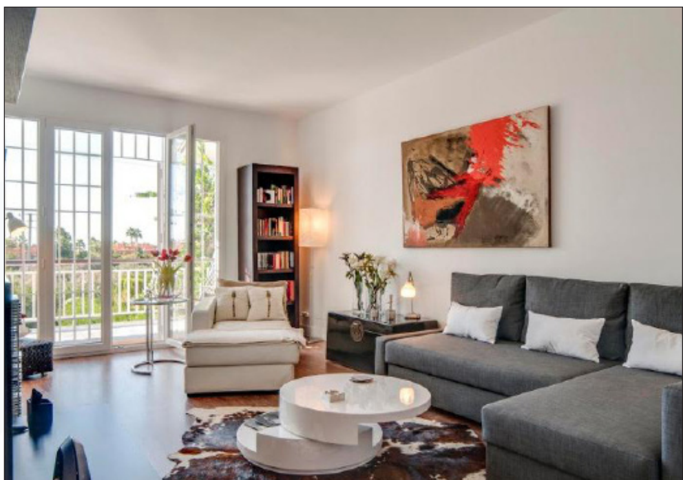
Light and spacious living room

There is a roulette inside the fridge that regulates the temperature. Please take into notice that it goes from 1 to 6, being 1 the coldest.