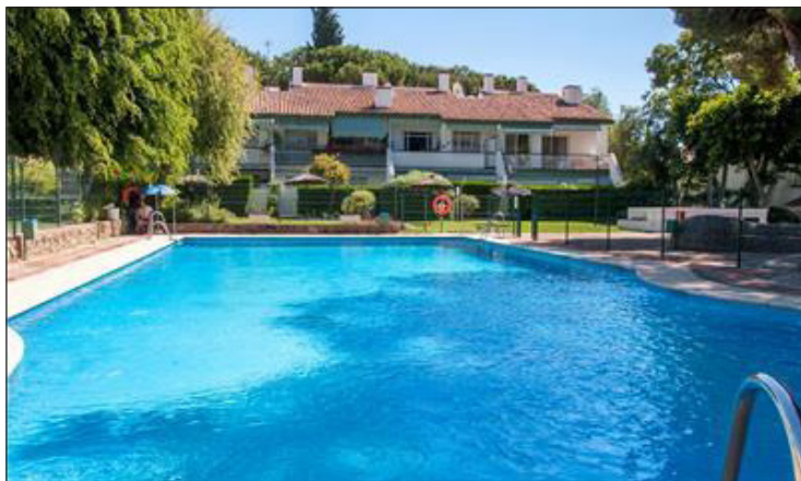
Refreshing swimming pool just a few steps away